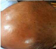
Figure 2b: Fungal infection of scalp