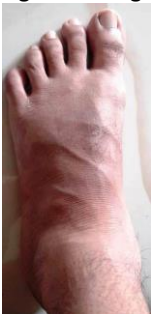
Figure 6a: Dorsal view of a foot after treatment.