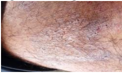
Figure 3b: Fungal infection of a thigh region.