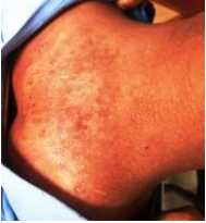
Figure 1: Fungal infection on bottom side of a neck.