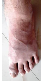
Figure 6b: Dorsal view of a foot after treatment.

Author contributions: GD: Developed an idea. BK, SG, DL, SP, JK, PS: Wrote the manuscript.