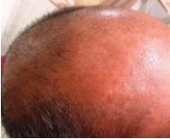
Figure 2a: Fungal infection of scalp