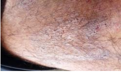
Figure 3b: Fungal infection of a thigh region.