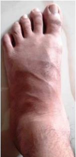
Figure 6a: Dorsal view of a foot after treatment.