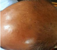
Figure 2b: Fungal infection of scalp