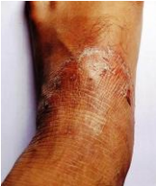
Figure 5: Fungal infection of the dorsal part of a foot.